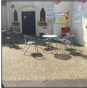
Castle Food Court and Main Restaurant